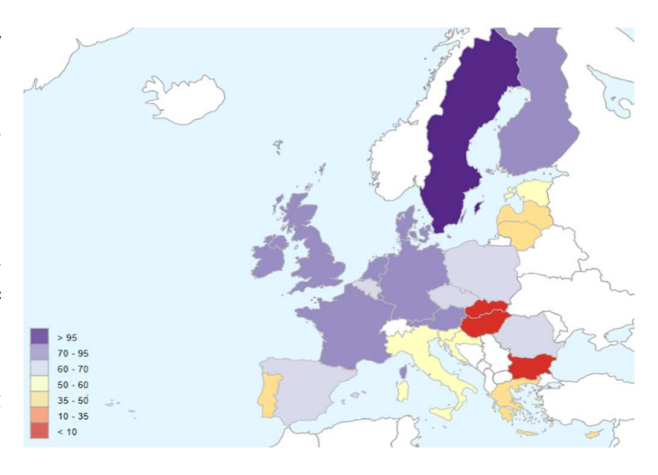
Figure 1: Domestic energy poverty index scores.

Another example is the European Domestic Energy Poverty Index (EDEPI) [11], that ranks member states based on their progress made in alleviating domestic energy poverty, considering both summer and winter domestic energy poverty. Figure 1 provides the EDEPI scores and, as it can be observed, Portugal, Italy and Spain have low scores, namely because they must alleviate both summer and winter energy poverty. The latter can be addressed by insulating homes and improving energy efficiency of heating systems, while the former requires a combination of insulation, passive cooling solutions such as shading, orientation, form, layout, fenestration design, and efficient cooling/ventilation systems.